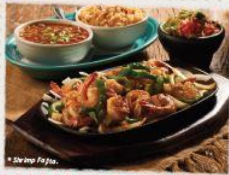
* Shrimp Fajita.

A new dish has arrived to San Antonio! Pericos' parrillada for two consists of grilled chicken fajitas, beef fajitas, and country sausage. Served on a sizzling hot skillet with Spanish rice, Charro beans, pico de gallo, and guacamole. $26.99