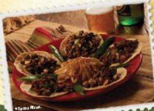
» Tacos Ricos

Nacho chips topped with grilled shrimp, pico de gallo and covered with monterrey Jack cheese. Served with fresh guacamole and jalapeños. $12.49